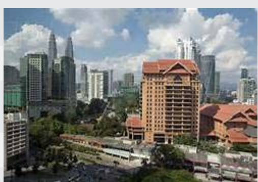
Kuala Lumpur ~ Malaysia's Capital and most populous city

Home for a short stay then off again. We flew to Kuala Lumpur, Malaysia next, myself from Virginia and Patty from Seattle. Malaysia was a lot like Singapore in temperature and humidity although not nearly as expensive. We could only get so much time off but we managed to scoot out to one of their resorts for a weekend. These resorts are plush, friendly, and very inviting. Within the city, we visited the twin towers seen in so many movies, the city aquarium which was very good, and spent St. Patrick's Day at an Irish Bar.